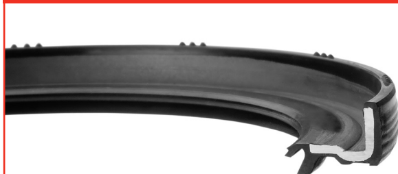
Standard Double Lip Contact Seal made by SKF®