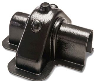
Pillow Block Cover with extended Shaft and Seal protection.