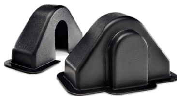
Closed and Open, Pillow Block Covers.

For specific and specialty applications we have wide range of Caps and Covers in stock. Please call Moline to discuss solutions.