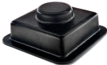
Closed, 4-Bolt Flange Cover