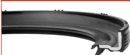
Standard Double Lip Contact Seal made by SKF®